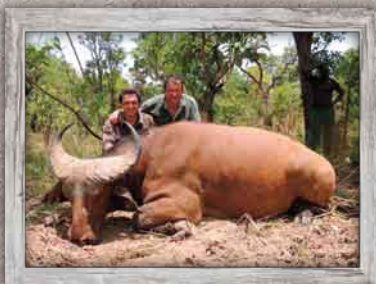
Western Savannah Buffalo