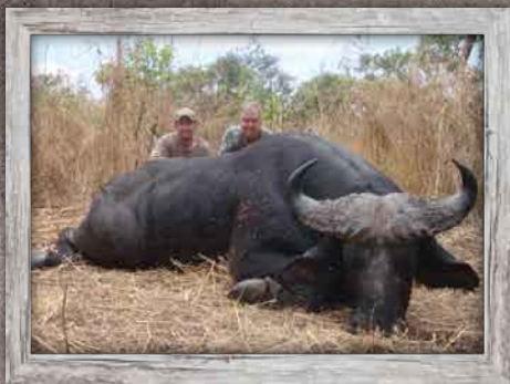
Eastern Savannah Buffalo