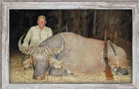
Central African Savannah Buffalo