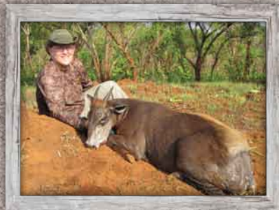
Yellow Back Duiker