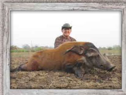
Red River Hog