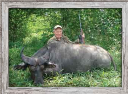
Dwarf Forest Buffalo