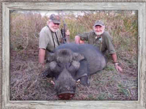
Giant Forest Hog