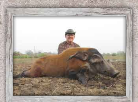
Red River Hog