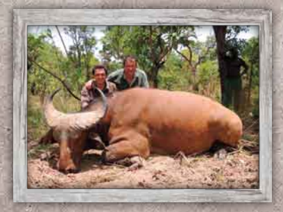
Western Savannah Buffalo