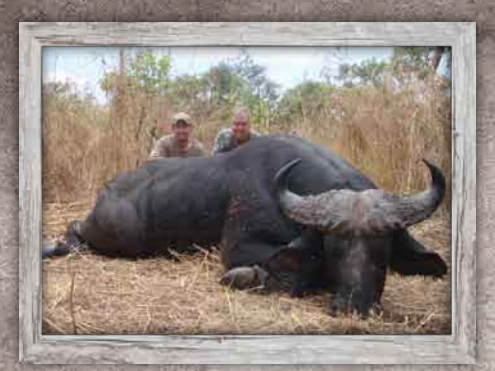
Eastern Savannah Buffalo