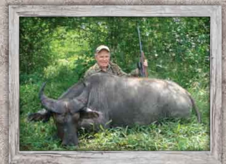
Dwarf Forest Buffalo