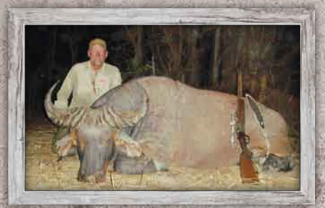
Central African Savannah Buffalo