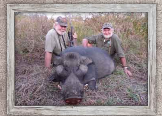
Giant Forest Hog