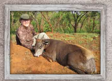
Yellow Back Duiker