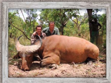
Western Savannah Buffalo