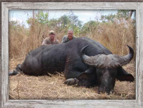
Eastern Savannah Buffalo