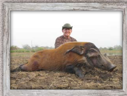
Red River Hog