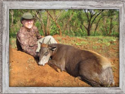
Yellow Back Duiker