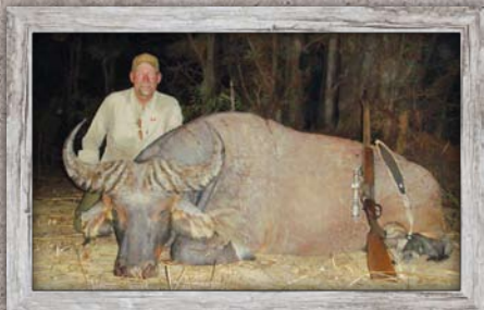
Central African Savannah Buffalo