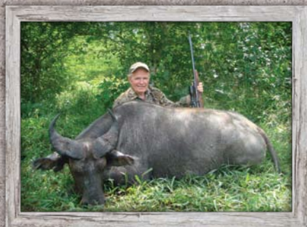
Dwarf Forest Buffalo