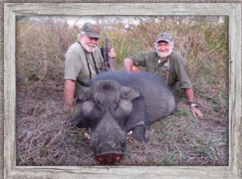
Giant Forest Hog